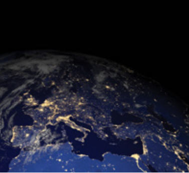
Smart Energy Saving